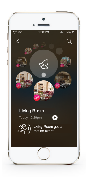
Enable detection sensors to automatically send push notifications to your mobile device