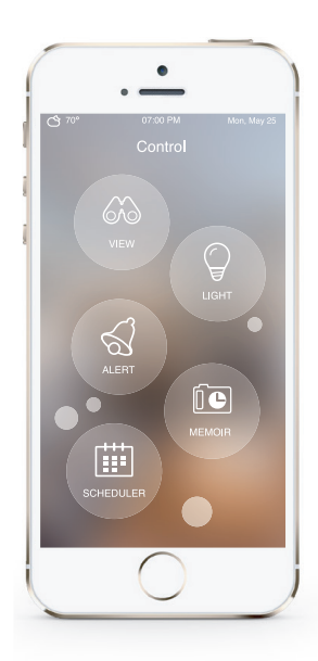
View and manage all of your Komfy devices with the easy-to-use mobile app available for iOS devices