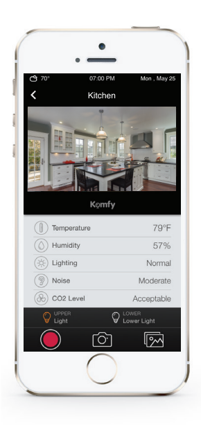
Check environmental stats, control individual light switches and record/ playback video clips