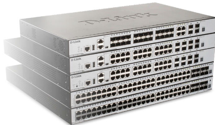
Figure 1. D-Link DGS-3630 Series Layer 3 Stackable Managed Switches

The DGS-3630 Series Layer 3 Stackable Managed Switches are designed for Small to Medium-sized Businesses (SMBs), Small to Medium-sized Enterprises (SMEs), large enterprises, and Internet Service Providers (ISPs). They deliver high performance, flexibility, fault tolerance, and advanced software features for maximum return on investment. With Gigabit Ethernet, SFP, 10 GbE SFP+, security features, and advanced Quality of Service (QoS), the DGS-3630 Series can act as core, distribution, or access layer switches. High port densities, switch stacking, and easy management make the DGS-3630 Series suitable for a variety of applications.